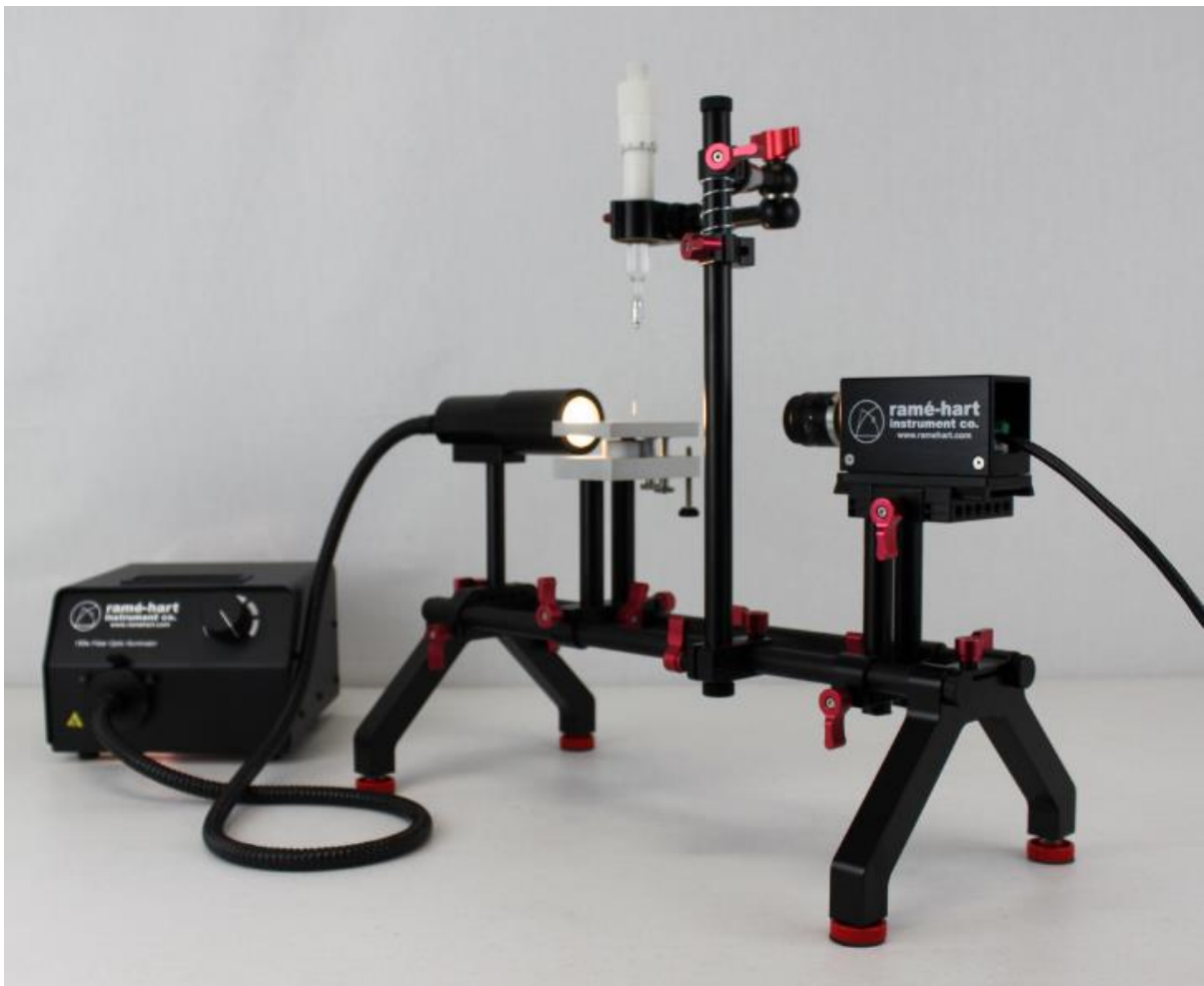
Model 90 shown with optional Fiber Optic Illuminator Upgrade