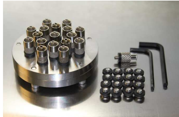
What's in the box