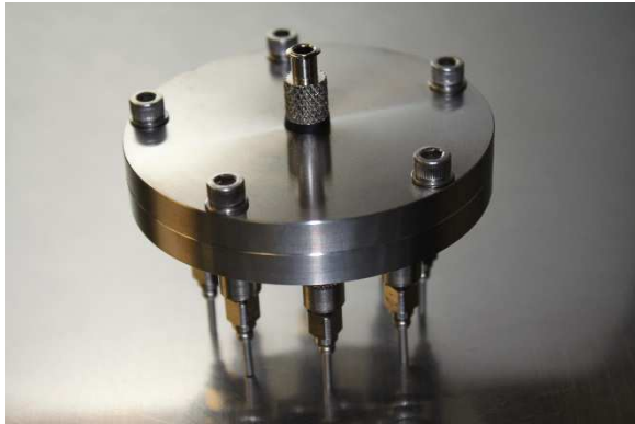
Top view of array with female Luer inlet