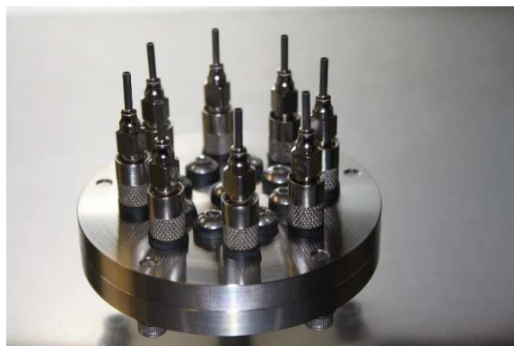
Array with (8) output needles installed on 50mm diameter circle

Many configurations are possible. Only a few common configurations are shown in this document.