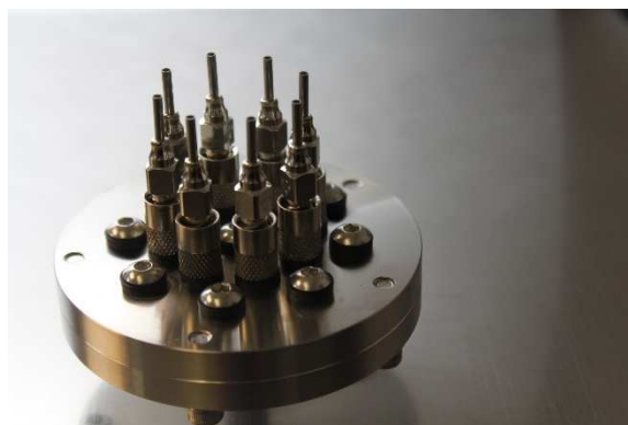
Array with (8) output needles installed on 32mm diameter circle