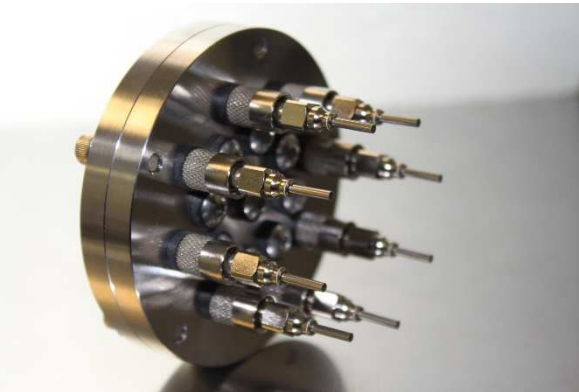
Side view with (8) output needles installed on 50mm circle