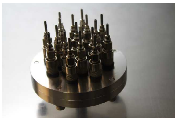
Array with all (17) output needle installed on both 50mm and 32mm diameter circles and (1) center needle