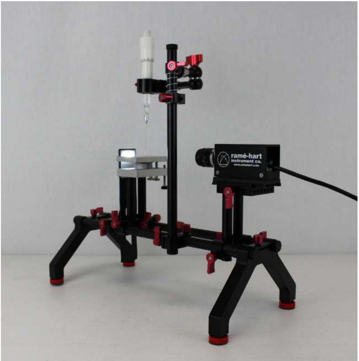
Model 90 Pro Edition Contact Angle Goniometer / Tensiometer