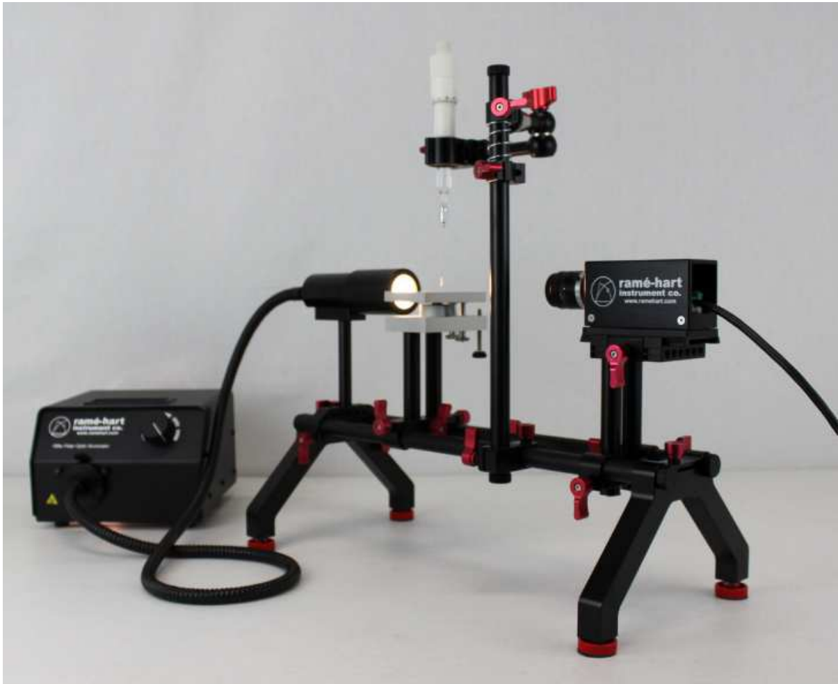
Model 90 shown with optional Fiber Optic Illuminator Upgrade